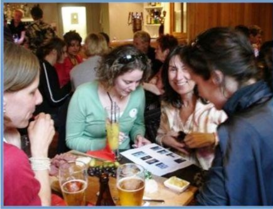
Global Challenge: International Quiz Night November 2007