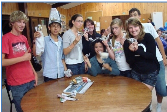
Senior French Camp, Rotorua Students show off their paper constructions on a French theme

Term 1 each year sees various Senior Language Camps take place in the Waikato-Bay of Plenty region. Venues are campsites within our region, such as Tui Ridge near Rotorua or Camp Raglan. This year saw the French and German language camps take place, both of which were highly successful, with numbers increasing from previous years. Senior students relish the opportunity to get together with other students studying their language, make new friends and practise their spoken language skills.